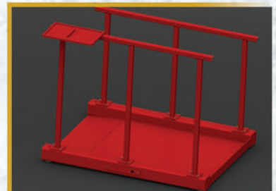
Patient wheelchair scale