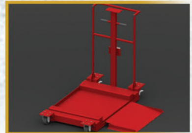
Wheel portability kit